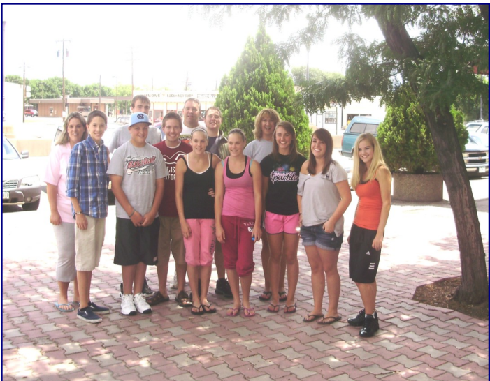
The RUMC Youth Group on their way to Purdue University.